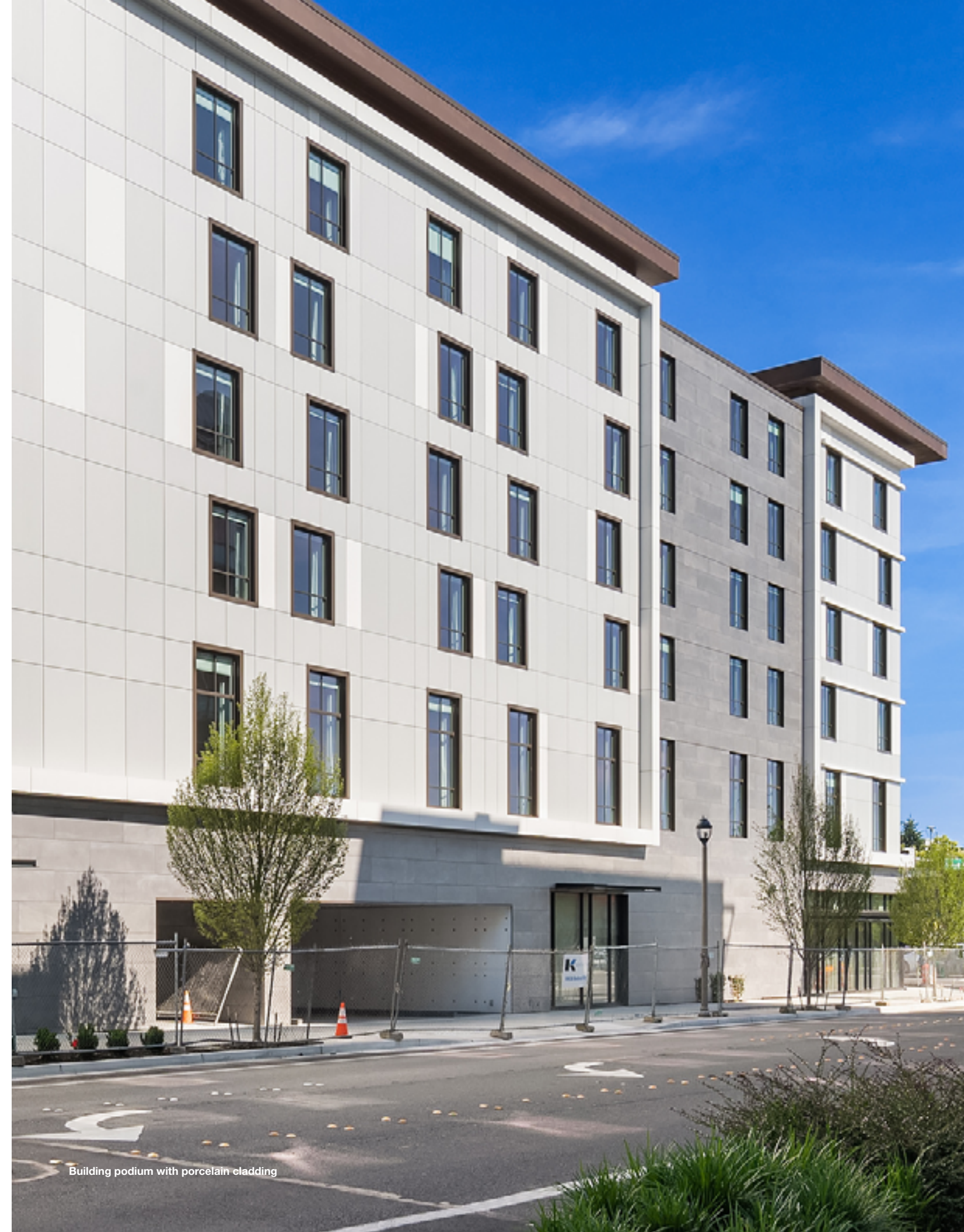
Building podium with porcelain cladding