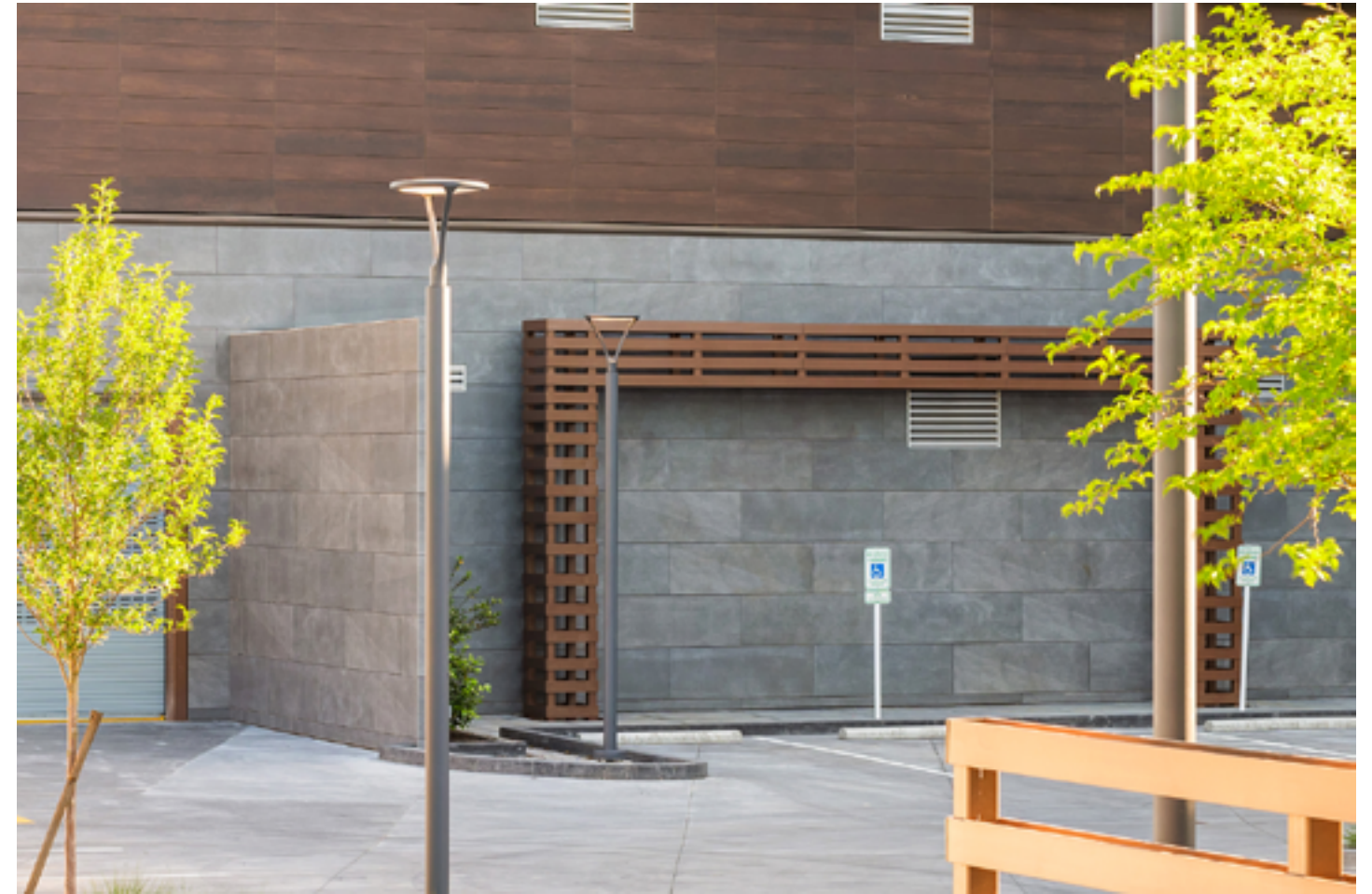
Large format porcelain cladding at ground level