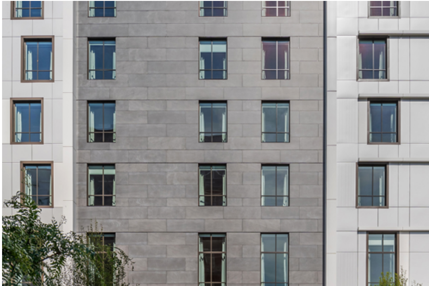
Staggered pattern porcelain cladding