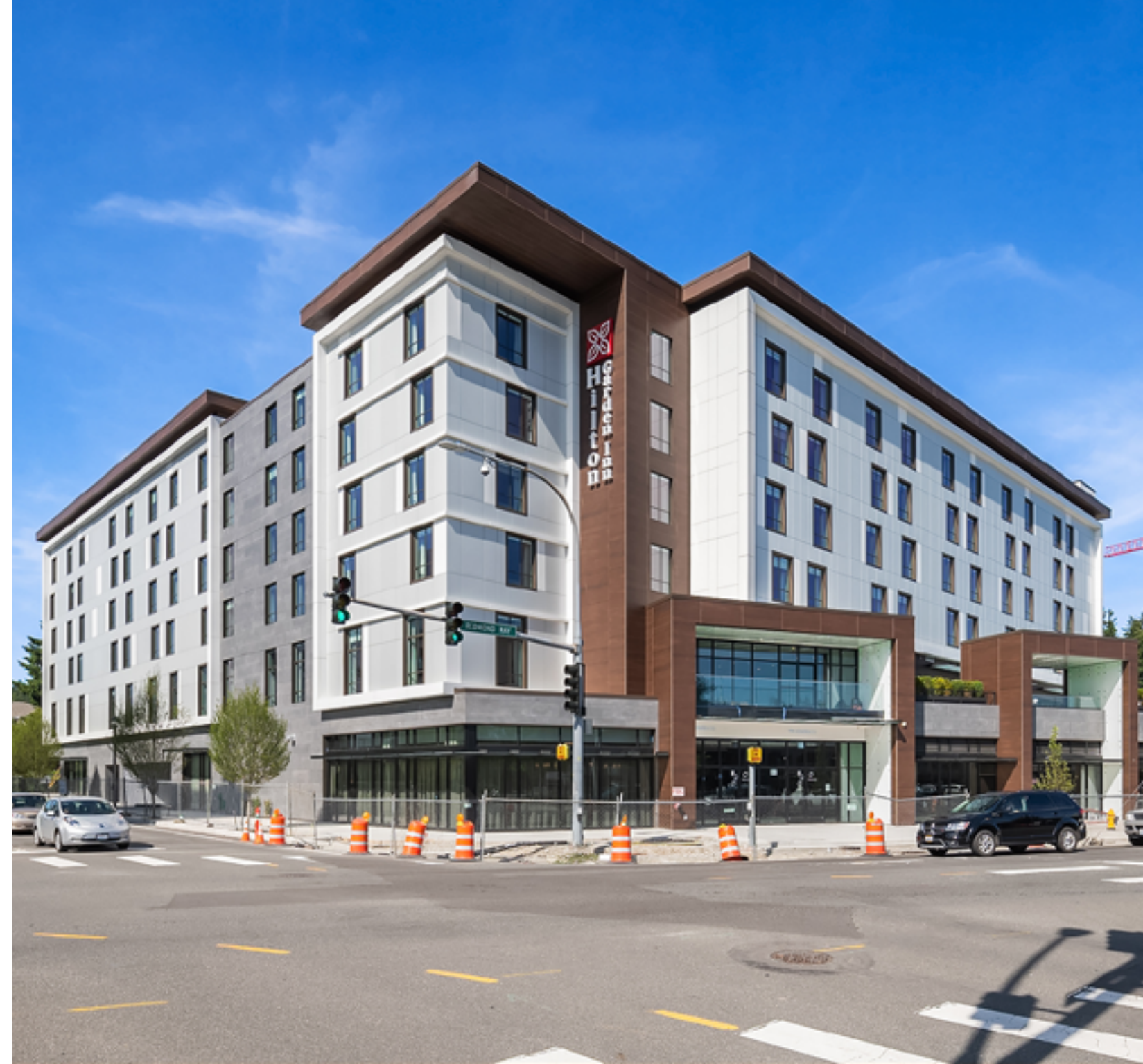
Porcelain facade accents