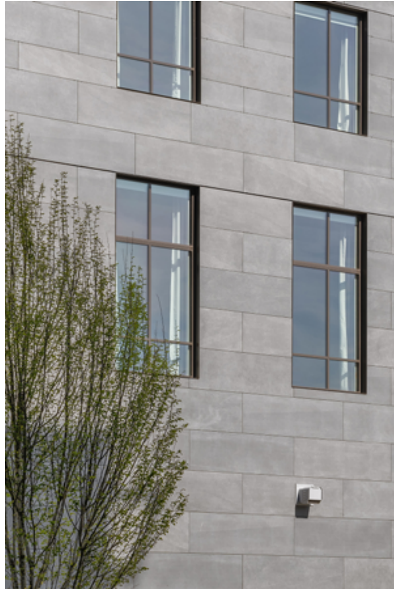
Staggered pattern porcelain cladding